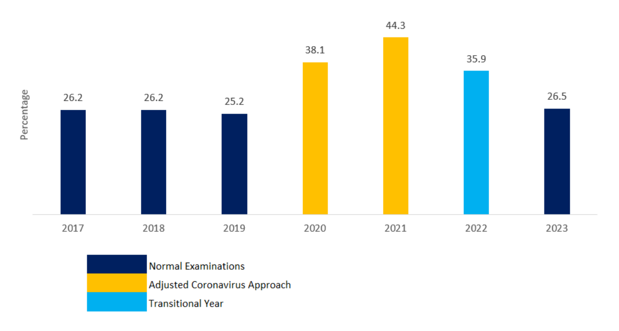
Percentage of A* or A Grades between 2017 and 2023 - National Average

A similar pattern can be seen in the table below for the other A-Level grades awarded between 2017 and 2023.